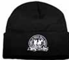
Woollen Beanie $10.00