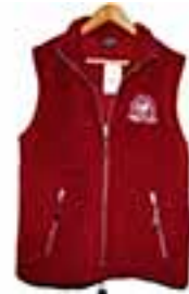
Polar Fleece Vest $45.00