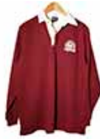
Rugby Knit Jersey $45.00