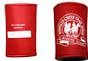
Club Stubby Holder $5.00