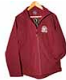
Shower proof Layered Jacket $85.00