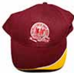
Baseball Style Cap $15.00