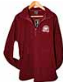
Polar fleece Top Short Zip $50.00