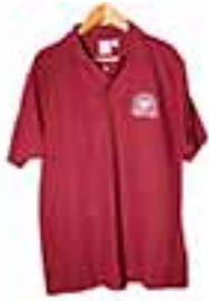
Polo Shirt $35.00