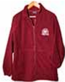
Polar Fleece Top Long Zip $50.00