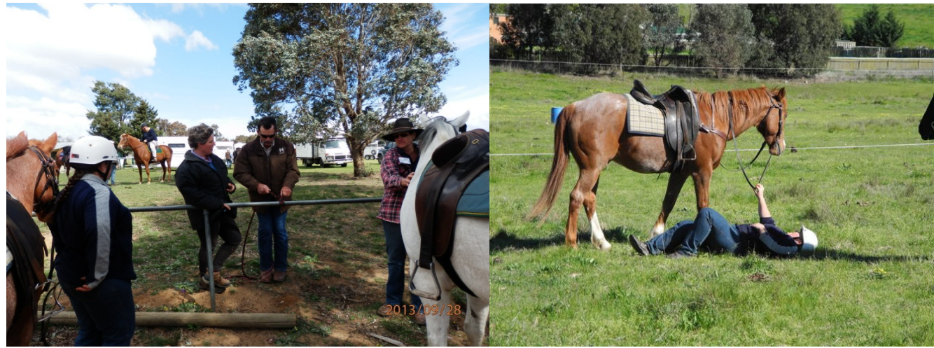
Quick release lead rope session