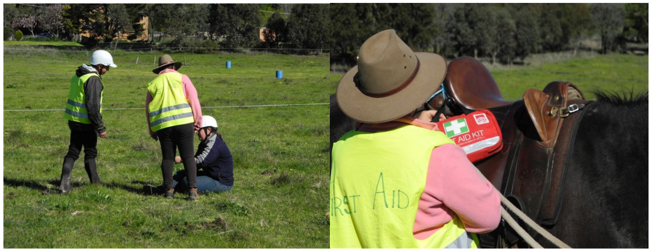
Sunday our very convincing patient