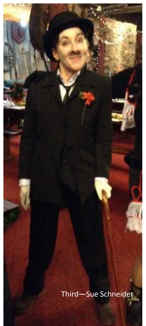
......And then there were all the other weirdos!!