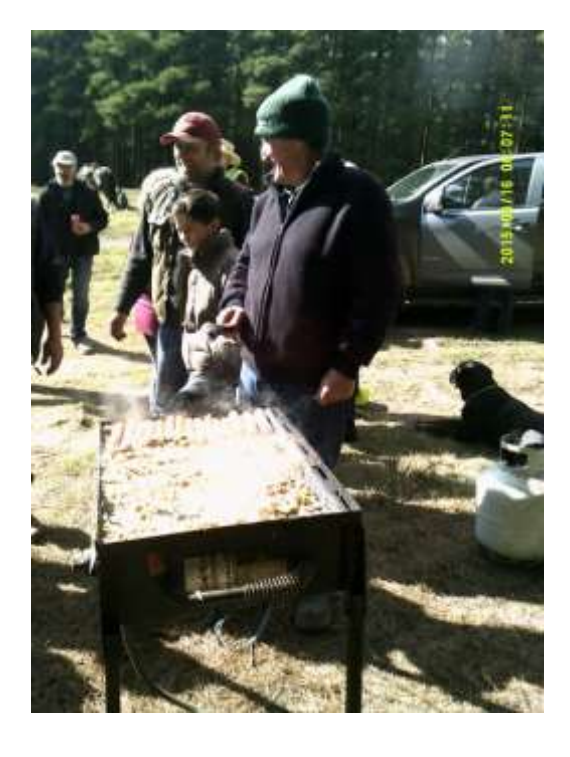
Of course they are cooked.