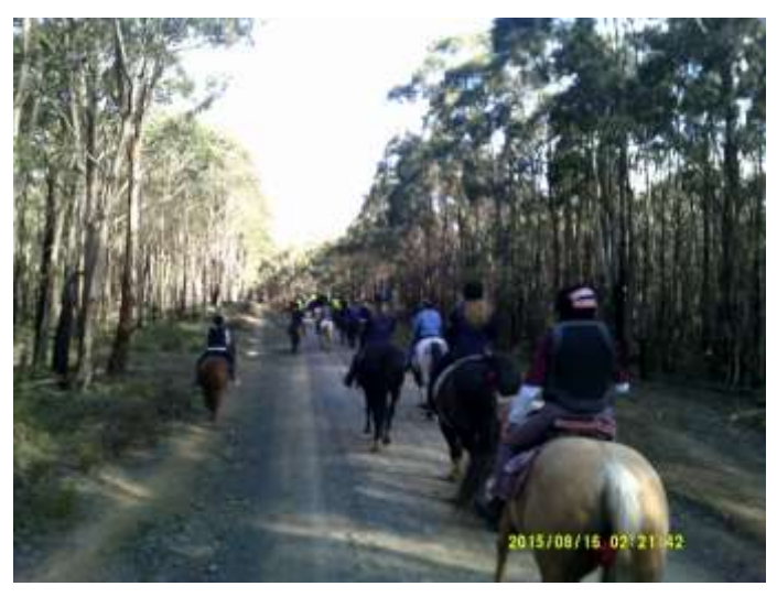
on our way home after a GR8 lunch.